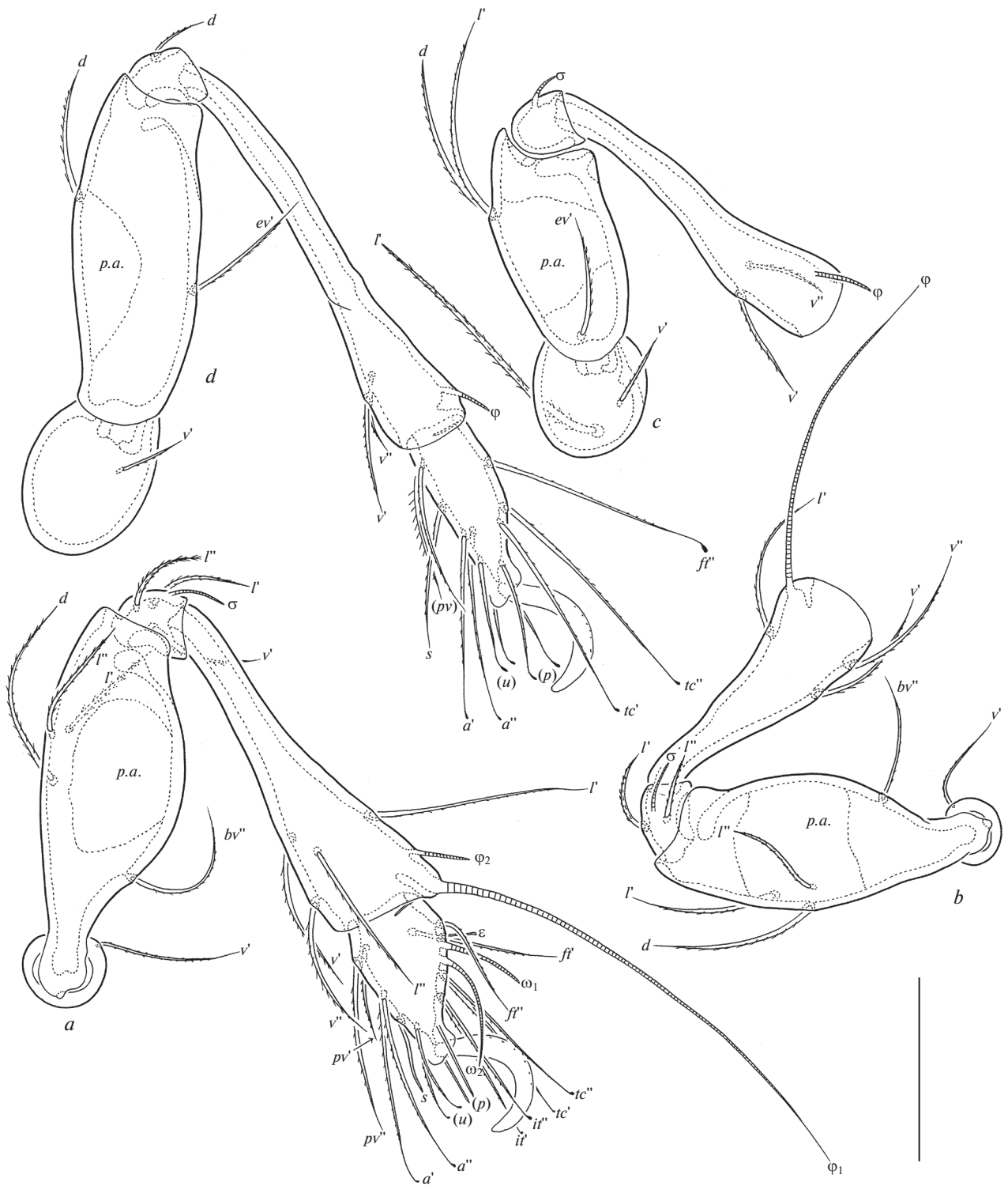
Fig. 3. Pseudotocepheus cattienensis sp. n., adult: a – leg I, right, antiaxial view, b – leg II, without tarsus, right, antiaxial view, c – leg III, without tarsus, left, antiaxial view; d – leg IV, left, antiaxial view. Scale bar 50 \mu m.

late) posterior part of notogaster; and setiform (versus dilated mediolaterally) seta d on leg femora I, II.